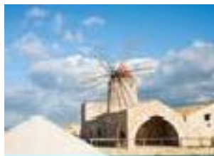
VIA DEL SALE

The amazing salt marshes of the Marsala Stagnone Lagoon